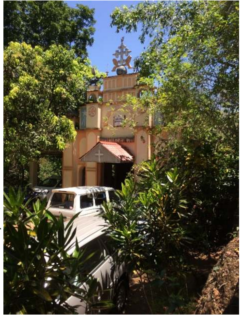
St Thomas Nilackal—Kerala

In addition there was the quarterly meeting of church leaders in St Thomas—Nilackal—in the Kerala hills. There was a tangible sense of the Church universal being together, and whilst acknowledging differences, there was a more pressing zeal for discerning how Christians could work together, to be a proactive voice in a multi-faith society like India, where Christians make up just 2½ percent of the