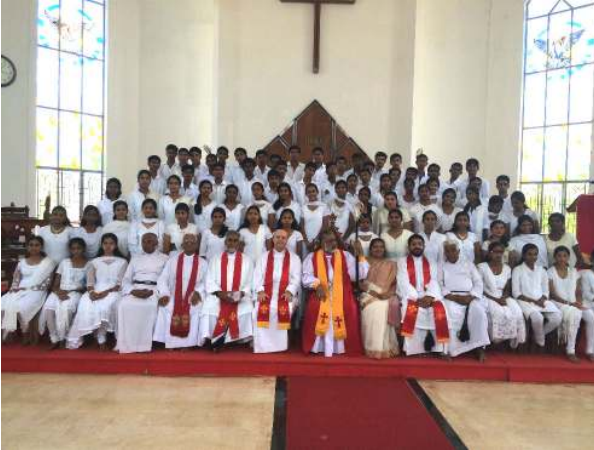
Parish confirmation in St Thomas Nedungadappally