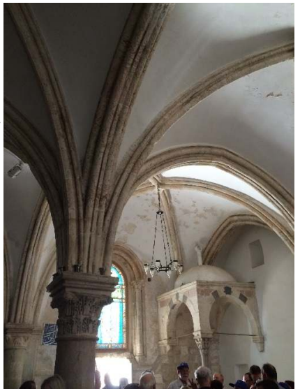
The Cenacle—Mount Zion—Jerusalem

For example I was impressed by the young people in Kerala, seeking ordination, who as part of the discernment process spend a year leading worship and providing pastoral care, as parish workers, before going to theological college to study. Then there were the seventy or so candidates from one parish